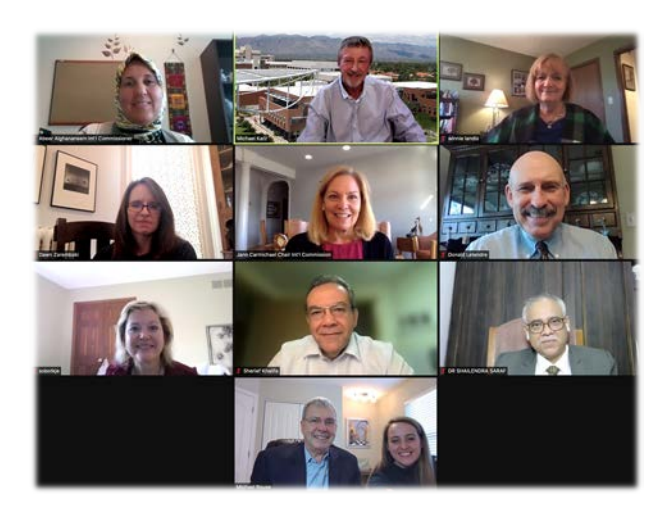
November 2021 IC Meeting

Recommendations of the ACPE International Commission were discussed and acted on by the ACPE Board of Directors on the following dates: