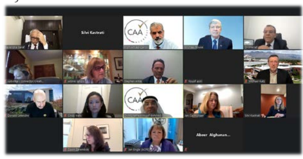
May 2021 IC Meeting