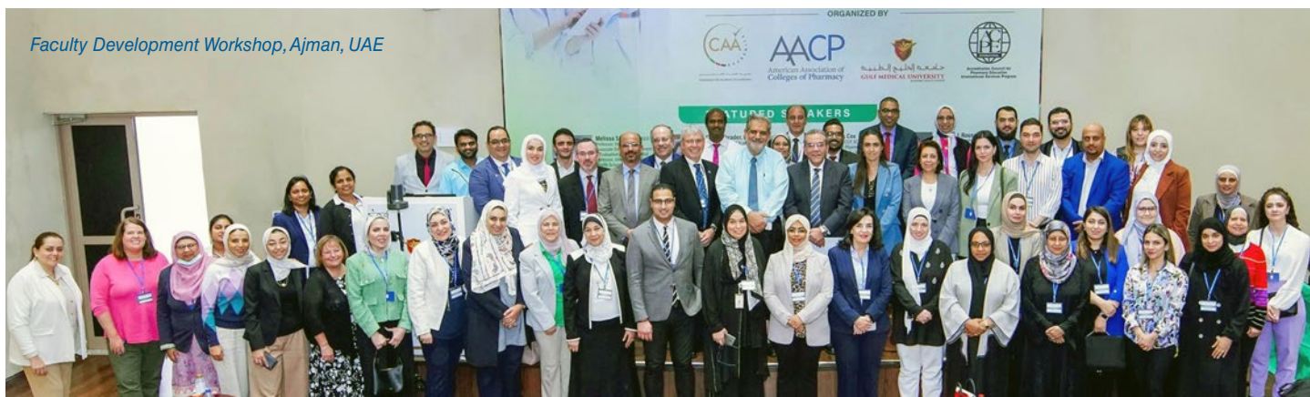
Faculty Development Workshop, Ajman, UAE