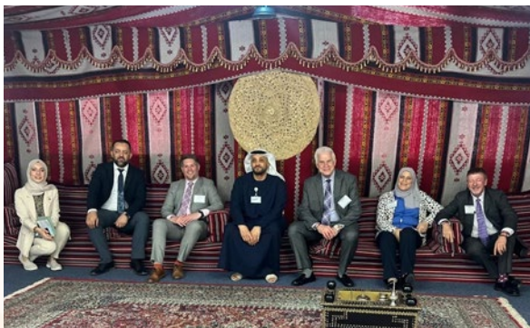
Site team and program faculty visiting a library in the UAE.