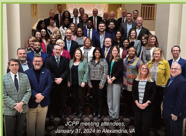
JCPP meeting attendees, January 31, 2024 in Alexandria, VA

ACPE staff welcome the opportunities to hear from our various stakeholders through these types of meetings. ■