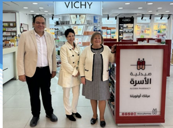
Site evaluation team visiting a community pharmacy in Jordan.