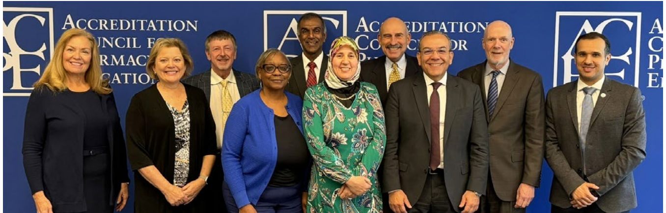
ACPE International Commission, November 2023