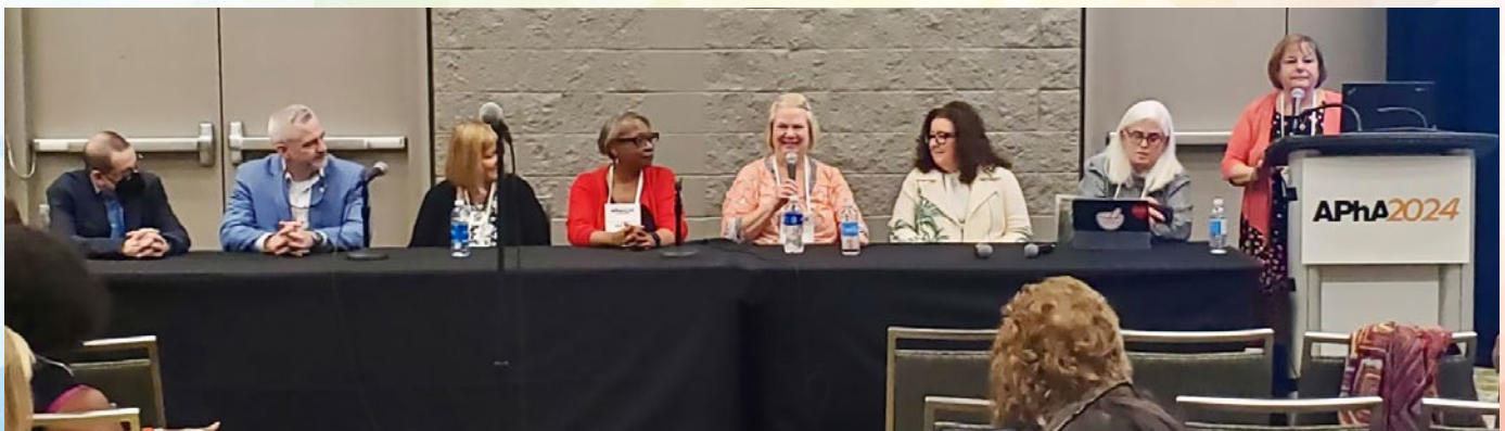
ACPE town hall presentation at the APhA Annual Meeting in Orlando.

After review of all comments received before the deadline prior to its June 13–16, 2024, meeting, the ACPE Board plans to finalize and release Standards 2025 at the June 2024 meeting, with full implementation by July 1, 2025. Prior to that date, all comprehensive evaluations will be conducted against Standards 2016. ■