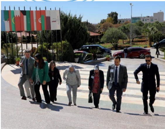
Evaluation team on a site visit in Jordan.