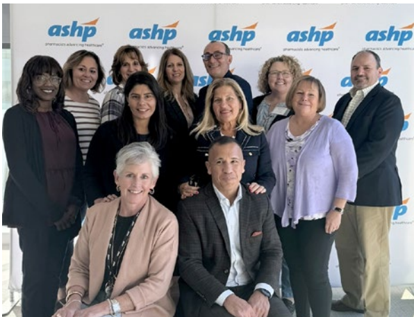
Pharmacy Technician Accreditation Commission

The ASHP/ACPE Pharmacy Technician Accreditation Commission (PTAC) meets twice yearly in May and October. Actions of the Commission are approved by both the ACPE and ASHP Boards in January and June. Each Commissioner, with the exception of public members, must have expertise and experience in quality assurance of pharmacy technician education and training and/or the contemporary education, training or practice of pharmacy technicians.